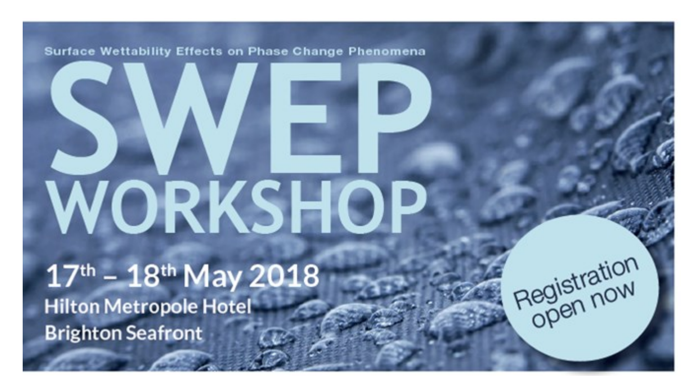
SWEP "Surface Wettability Effects on Phase Change Phenomena"

This workshop aims at providing a forum and a brainstorming session for researchers to exchange knowledge on two-phase flows experiments, modeling and simulation, to discuss with worldwide experts their current research, and to propose a better comprehension on the effect of surface wettability on phase-change phenomena.