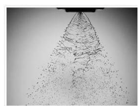
14<sup>th</sup> International Conference on Liquid Atomization and Spray Systems